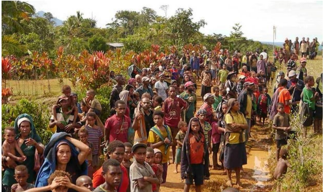
Fig 2: People in Southern Highlands waiting for the arrival of food. 8 March 2018