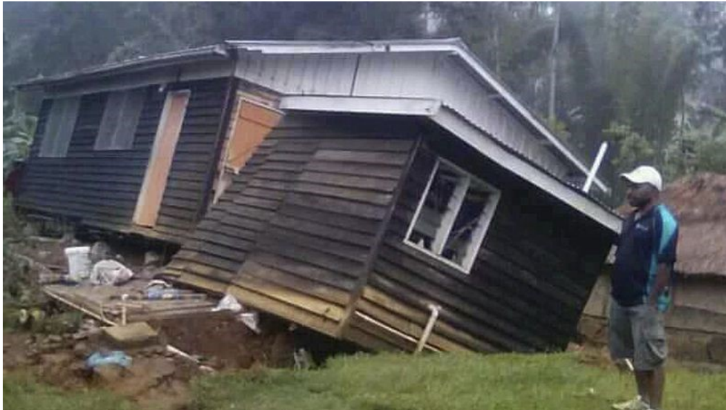
Fig3. A man views a house that collapsed in Halagoli, Hela Province.