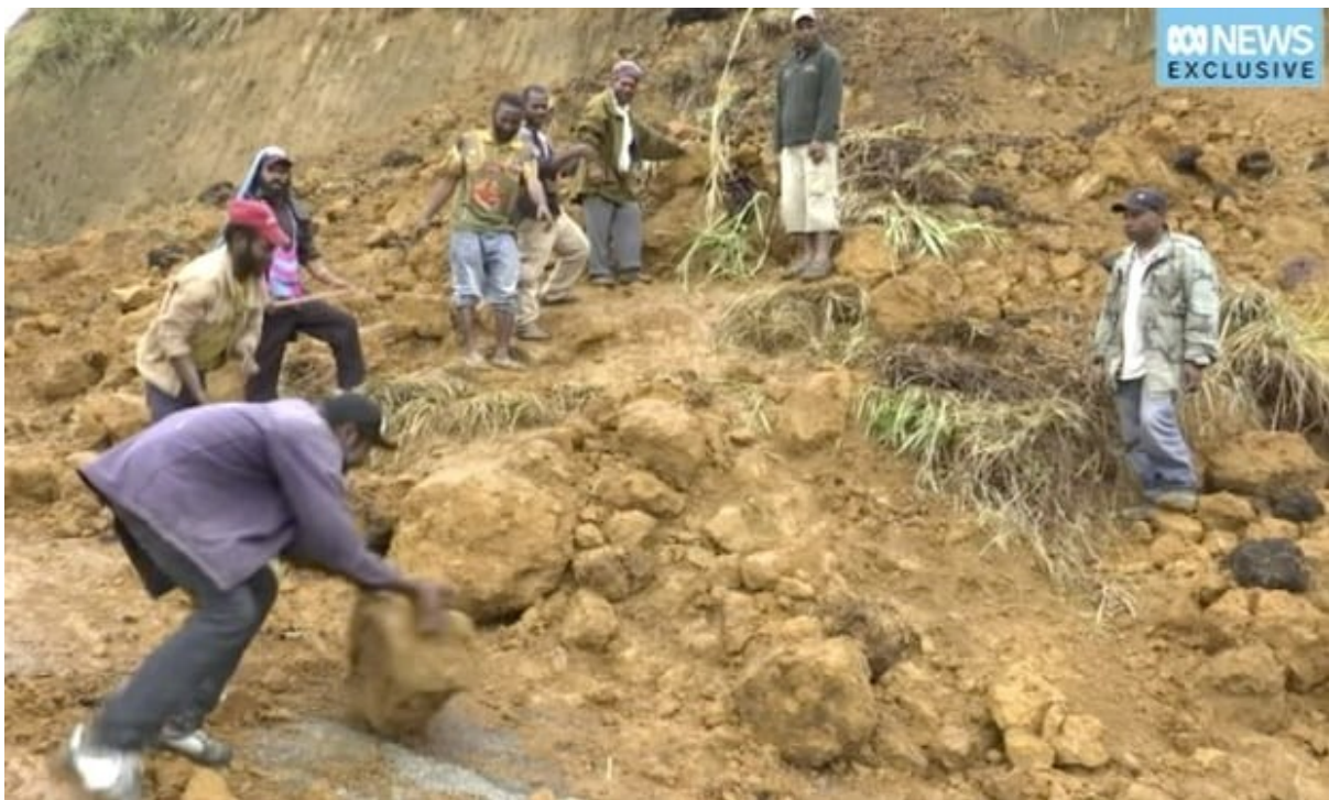
Fig 4. Villagers clear a landslide by hand.